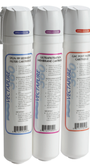
Triple Stage Ultrafiltration System Zero waste and no tank required V3603UF