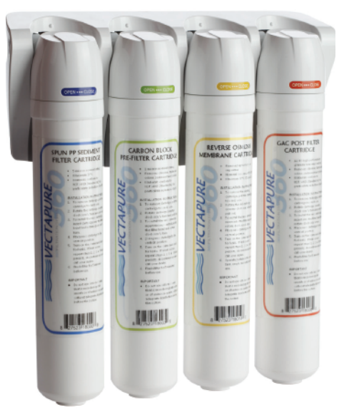
Four Stage 75 GPD RO System Includes tank and accessories V3604RO